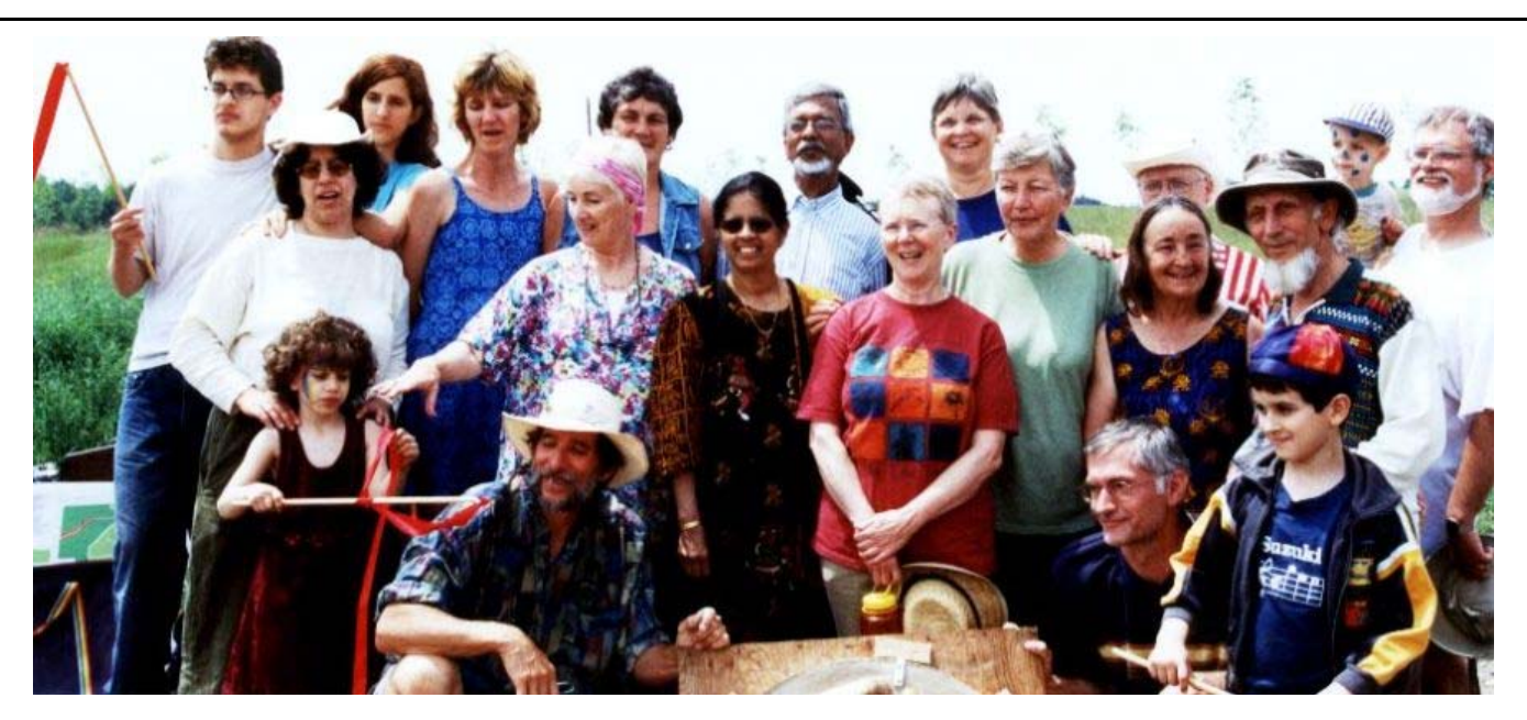
Whole Village members pose for a group photo shortly after participating in the Foundation Stone ceremony on July 18th.

Greenhaven's walls and roof consist of Structural Insulated Panels (SIPs), manufactured by Thermapan of Fort Erie (www.thermapan.com). The panels are a sandwich of oriented strand board and polystyrene insulation. Wall panels are 4 feet by 9 feet and 8½ inches thick (R32), while the roof panels are 4 feet wide and anywhere from 8 to 16 feet long (R39). The roof is flat.